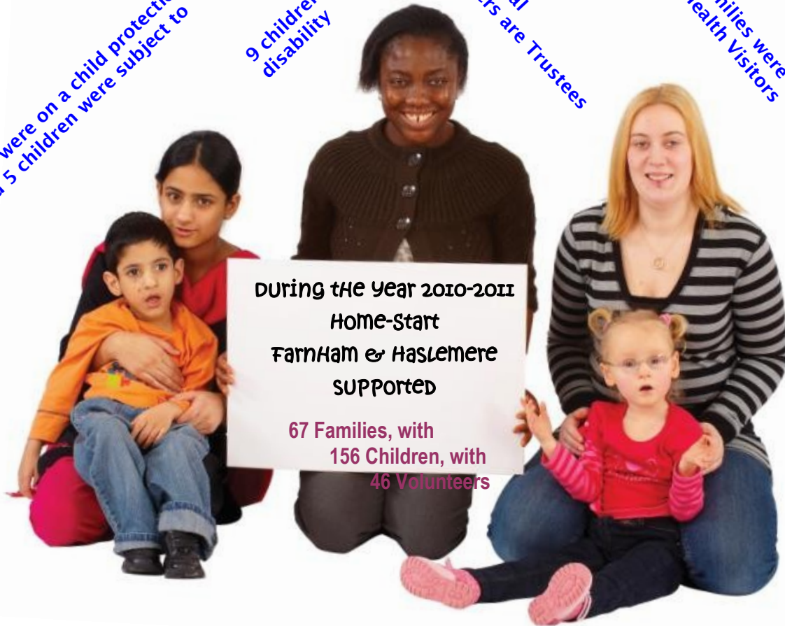
No of families for whom things were better after Home-Start support (based on those for whom support has ceased and a final visit taken place)

39 families were referred by Health Visitors